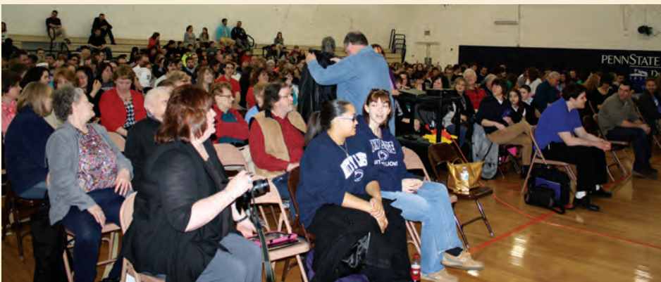
It was standing room only in the campus gym.

Prior to joining MLB, Sharon had a 20-year career as a nurse-midwife and educator. She taught in such prestigious universities as: Yale, Columbia, Howard, and Georgetown and is Vice Chairman of the Jackie Robinson Foundation. Robinson received her bachelor's degree from Howard University and master's from Columbia. She went on to earn a post-master's Certificate in Teaching from the School of Nursing at the University of Pennsylvania and received honorary doctorates from: Medaille College, Dowling College, and Monmouth College. Sharon lives in Sarasota, Florida and New York City. ▶