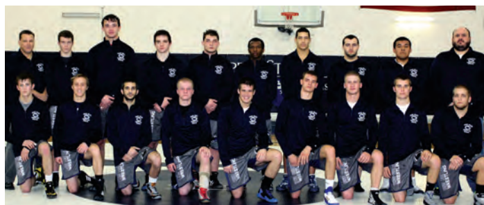
Penn State DuBois Wrestling Team