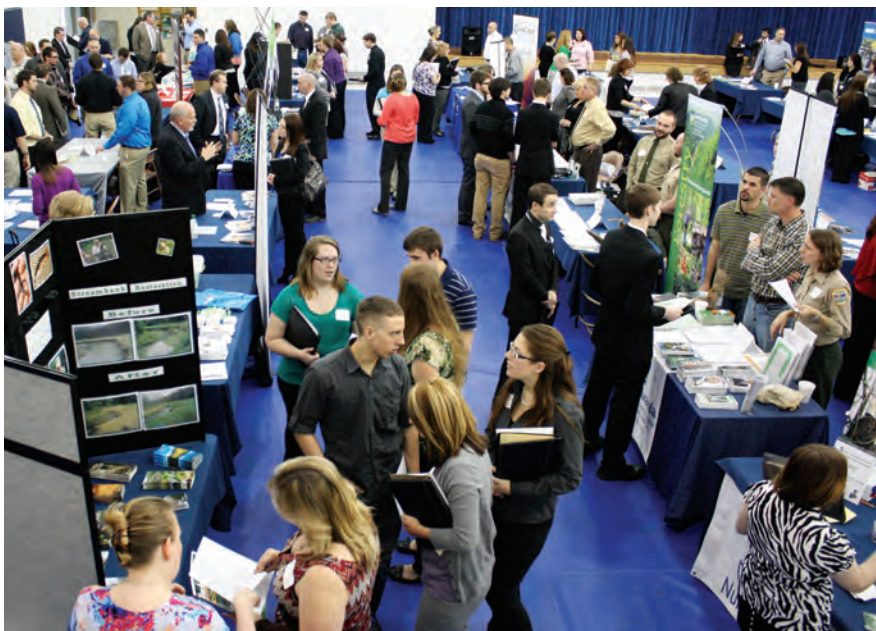
A bird's eye view of networking during the open career fair in the campus gymnasium.