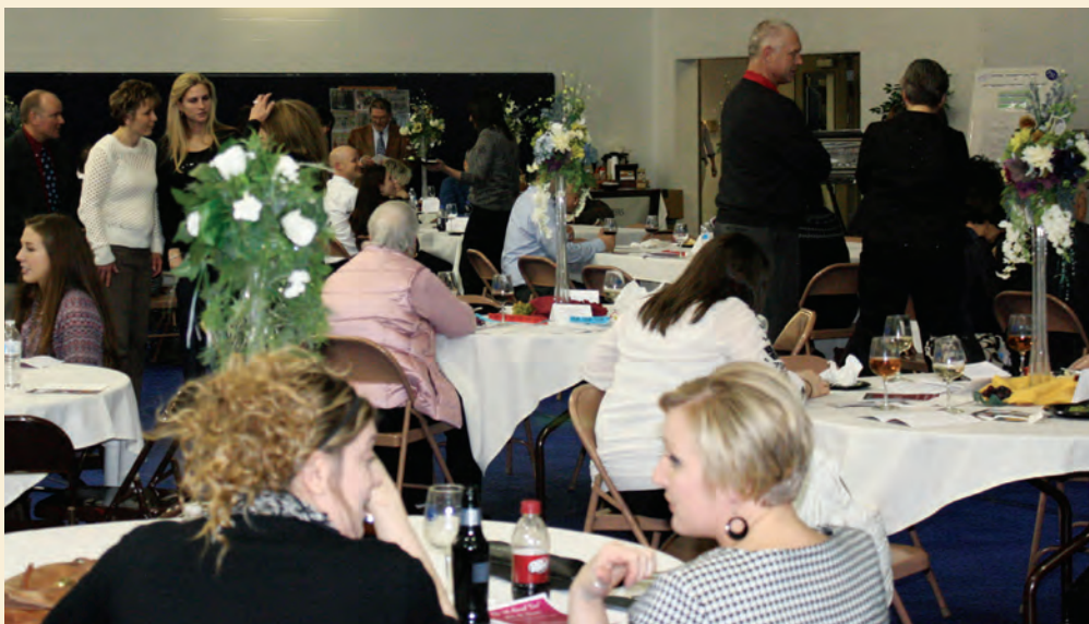
Guests mingle at the Seventh Annual Lion Wine and Cheese.