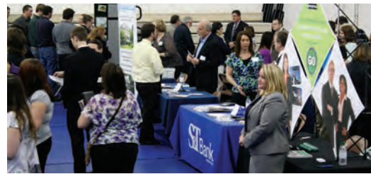
Employers stand ready to meet potential employees during the career fair.